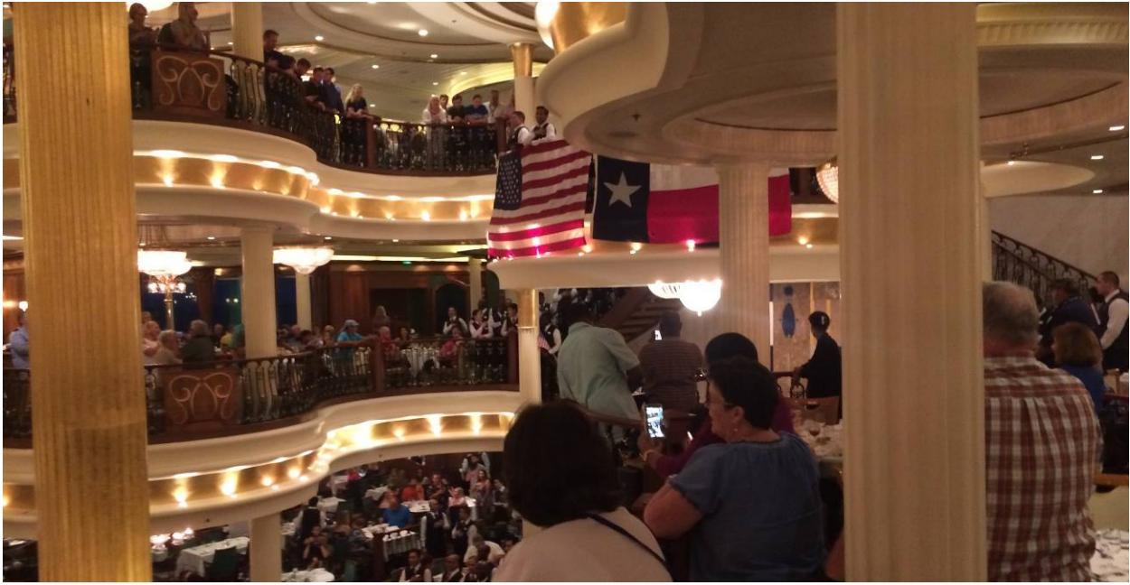
Ships passing in the night