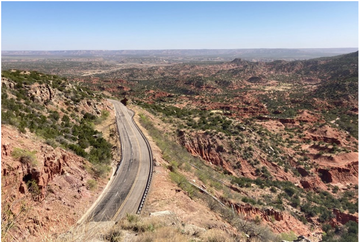
Palo Duro Canyon

All of the Riders and Co-Riders who participated in this portion of the Tour made it to 27 of the 50 points on the 2022 Motorcycle Grand Tour of Texas, and therefore will qualify as Tour Finalists. Our goal now is to visit the remaining points and have everyone become Tour Finishers.