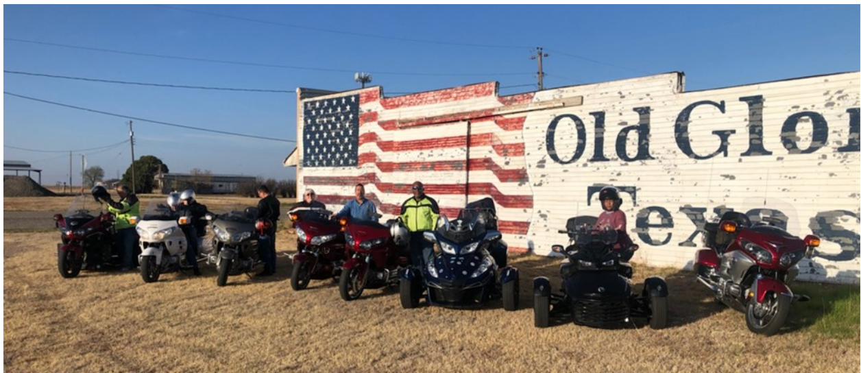
Stopping in Old Glory, Texas

All of the Riders and Co-Riders who participated in this portion of the Tour made it to 27 of the 50 points on the 2022 Motorcycle Grand Tour of Texas, and therefore will qualify as Tour Finalists. Our goal now is to visit the remaining points and have everyone become Tour Finishers.