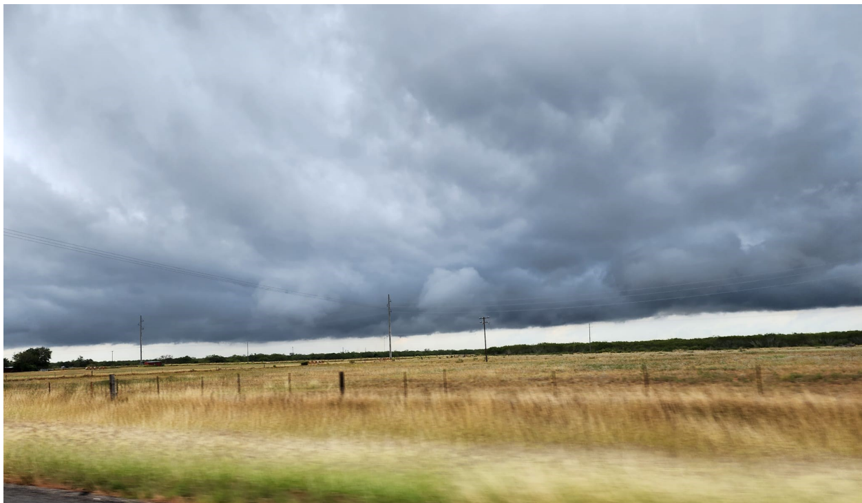
Stark country with some small showers

Leaving the San Antonio vicinity is something I always look forward to, as I know I will see new roads, towns, and Texas countryside. The ride through this part of south Texas is predictably austere with lonesome houses, large ranches with mesquite trees and some cattle, and small towns that often appear to still be barely hanging on, as they have for many years. It is easy to visualize why some old pioneer types stopped where they did; some because they had purchased land and were finally home; and others possibly decided that this was as good as it was going to get, and just decided to settle here. I was glad to have a destination, a trike to roll up the miles, and a home in the “big” city to return to.