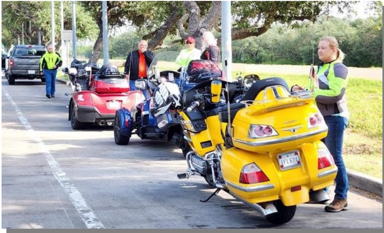
One of many stops along the MGTT

Over the past 7-8 months I have ridden my Honda trike over much of the great state of Texas, and one small part of New Mexico. It's been a fun-filled adventure travelling as far West as Hobbs, New Mexico; as far East as Lufkin; as far North of Amarillo, to the little town of Borger; and as far South as Big Bend National Park, and South Padre Island.