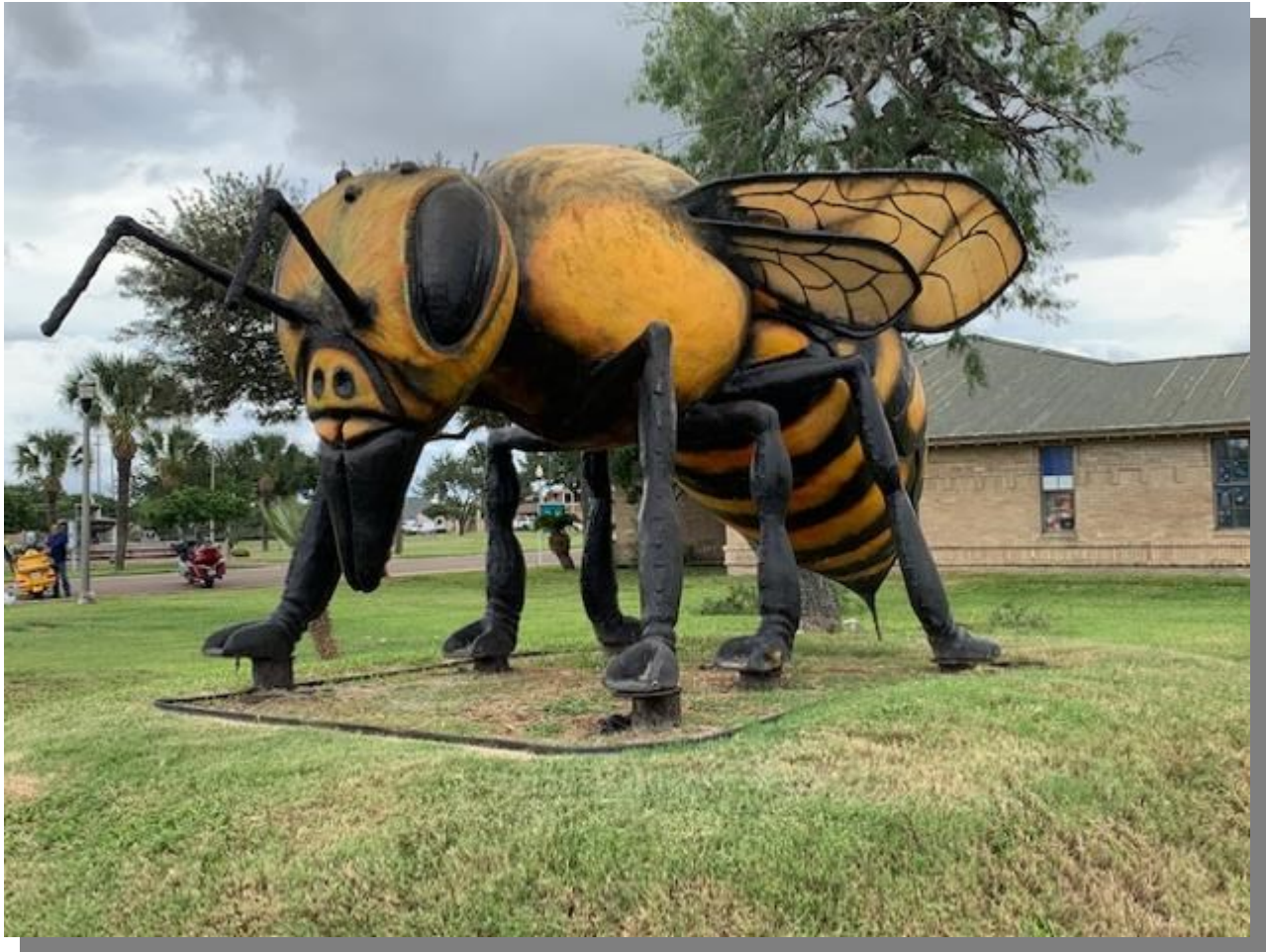
World's Largest Killer Bee (24)

Along the way we paralleled the Rio Grande River and saw large portions of “The Wall” along the Southern U.S. border. It was interesting to see the amount of construction on the wall that was finished, and we also noticed that so much was unfinished, i.e., there were large sections of finished wall but also large holes where we presumed gates were to be installed. As it stood, it did not appear, in many places, that it would stop anyone from crossing the border.