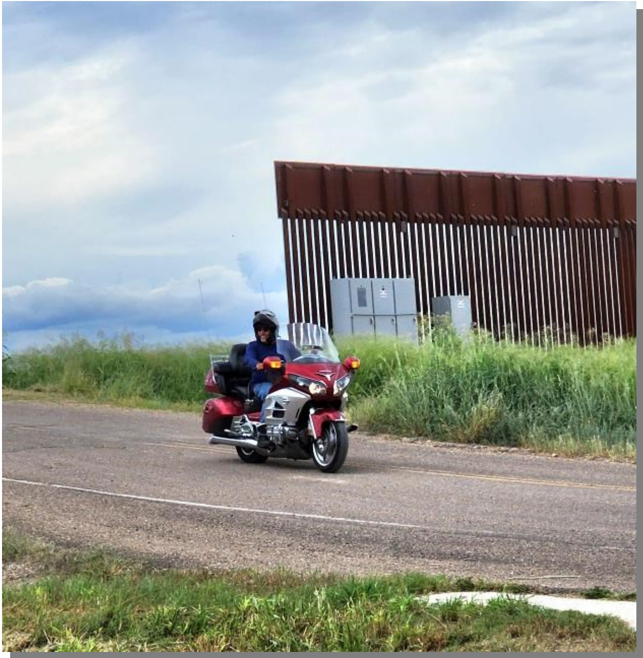
Driving through “The Wall”

We finished our riding day taking photos of the South Padre Water Tower and checking into our respective hotels. We ate dinner at the Meatball Café, which was recommended to us; we fully endorse it, as they make some wicked Italian food. We retired to the pool after dinner for some hydration therapy, where we were treated to a fireworks demonstration to top off our day.